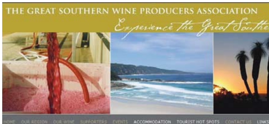
The new Great Southern Wine Producers' Association web site