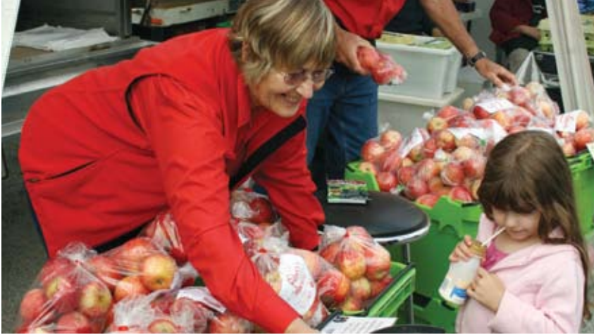
Food education starts early at the Farmers' Market

The Albany Farmers' Market received Australia-wide recognition when it received the award of 'Best Farmers' Market' at the Vogue Entertainment and Travel Awards in Sydney in May.