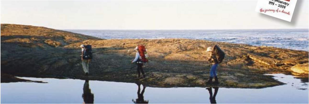
Pleasures of a coastal walk